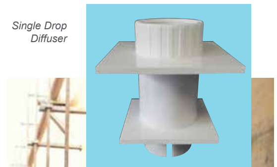
Single Drop Diffuser