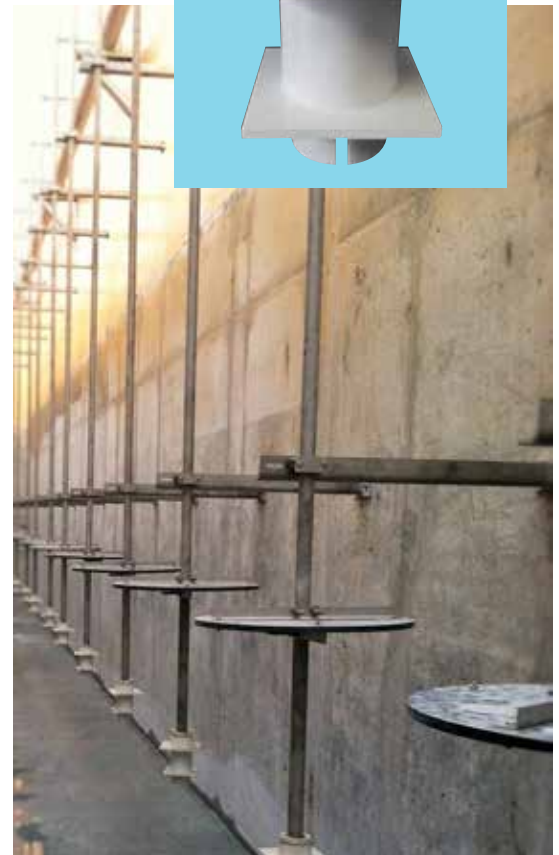
Single Drop Diffuser Installation