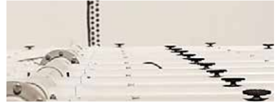
Flexcap Diffuser Installation