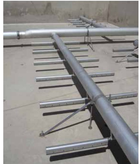
Wide Band Diffuser Installation

Diffused aeration system design and performance is based on type, diffuser density, submergence and airflow rates.