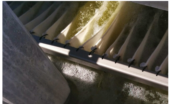
Reeseville, Wisconsin Nebula MultiStage Pretreatment System