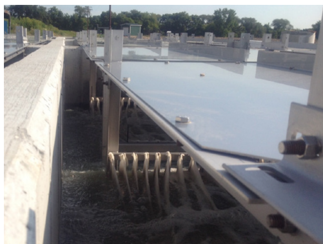
Nebula MultiStage Pretreatment System provides process stability during variable flows and loadings.

The Nebula Biofilm pretreatment system began operation in 2014. Preliminary performance data indicates over 90 percent BOD5 removal is achieved.