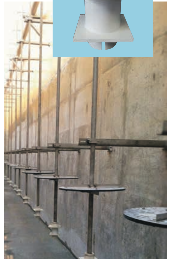
Single Drop Diffuser Installation