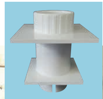
Single Drop Diffuser