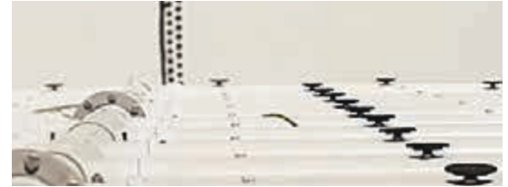
Flexcap Diffuser Installation