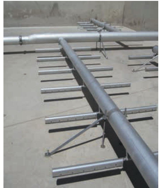
Wide Band Diffuser Installation

Diffused aeration system design and performance is based on type, diffuser density, submergence and airflow rates.